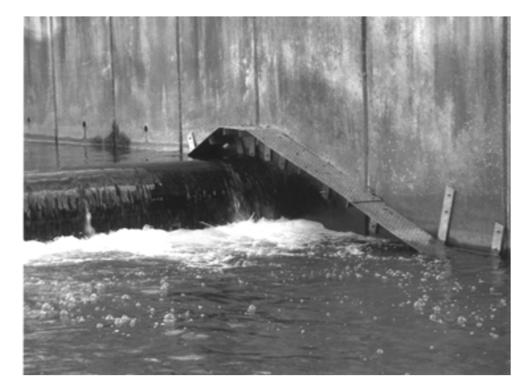
Figure 3 - Otter ramp over a weir where five casualties had occurred prior to its installation

It is important to bear in mind the fact that it may still be beneficial to reduce