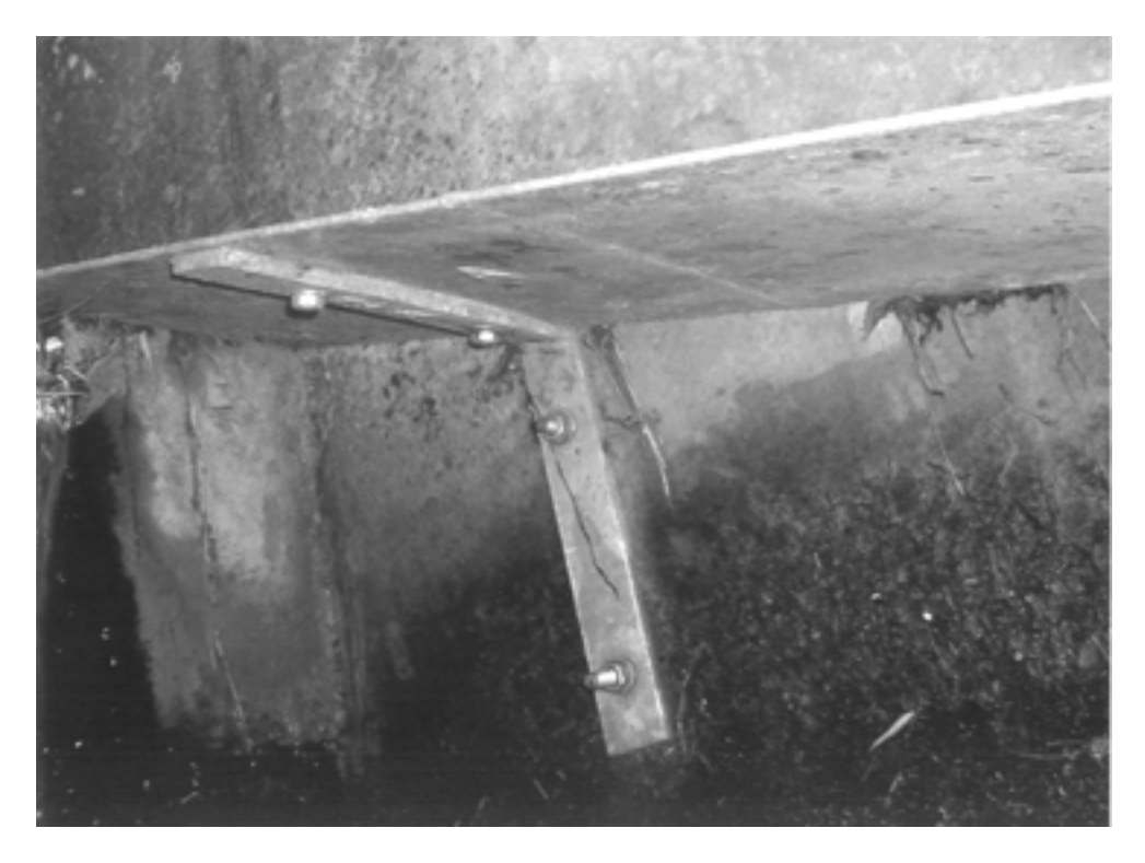
Figure 4 - Close-up of ramp and support.

vert'). These can be extremely expensive and disruptive to install after the initial construction of a road but they should not have any impact on the structure itself, do not run the risk of creating an obstruction and are much less likely to suffer damage during severe flood events. Generally, for post-construction mitigation, it is most cost-effective to install these when other road works are undertaken at the same time.